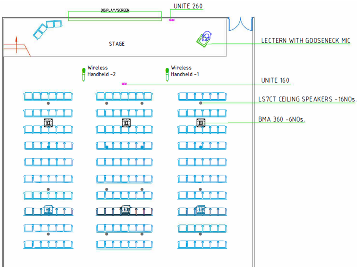
LARGE LECTURE HALL